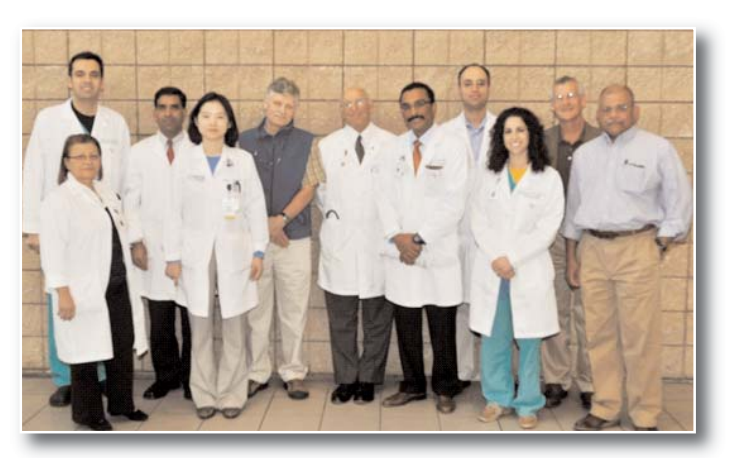
Multidisciplinary Head and Neck Cancer Clinic Team

Neck tumor conference and discuss cases and review radiology and pathology, and then we go and see patients together in head and neck clinic. After seeing patients we again get together and make treatment recommendations depending upon patient's condition and disease stage, in this way patients have a chance to meet with different specialists and all questions are answered in one setting. Also because of proton therapy center we are able to treat complicated and difficult cases.